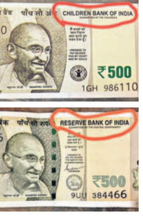
(Top) Rs 500 fake note with 'Children Bank of India' (below) original currency.

However, such dummy prints are also being used by counterfeit currency gangs to cheat gullible people. The Cyberabad SOT along with Mailardevally police arrested two conmen who tried to cheat an eatery by paying notes issued by the 'Children Bank of India'. Officials seized 10 bundles of such notes valued with a face value of Rs 6.6 lakh from them. Gangaraju and Abhinandan, residents of Punganur of Chittoor, allegedly were cheating people by keeping fake notes among the original Rs 500 currency notes and exchanging them. (SEE PAGE 2)