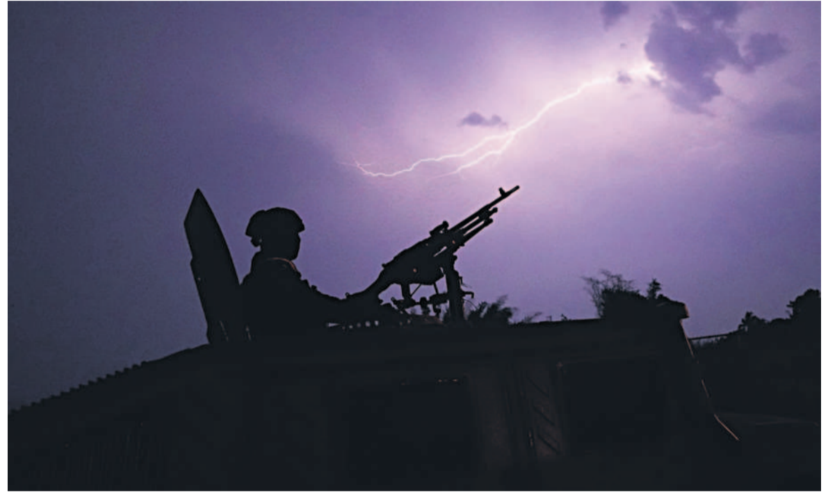
ON GUARD: Lightning illuminates the sky behind the gunner on a Thai military armoured vehicle, as he keeps watch along the Moei river, under the 2nd Thai-Myanmar Friendship Bridge in Mae Sot on Friday. (REPORT PAGE 8)