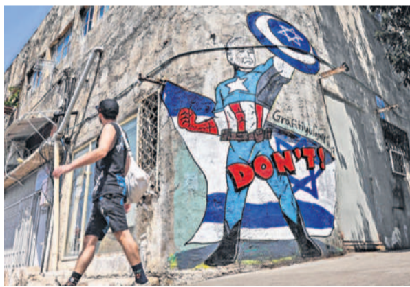
A man walks past a mural depicting US President Biden dressed as comics character 'Captain America', in Tel Aviv.

The Iranian attack on Saturday, less than two weeks after a suspected Israeli strike in Syria that killed two Iranian generals in an Iranian consular building, marked the first time Iran has launched a direct military assault on Israel.