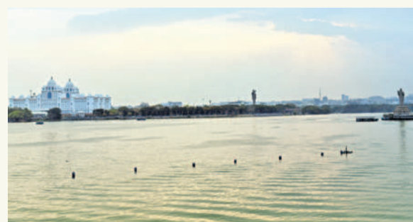
IMD estimates cumulative rainfall to reach 106 per cent of the long-period average, set at 87 cm.

In its forecast, the weather agency said that conditions were favourable for monsoon due to the signs of weak-