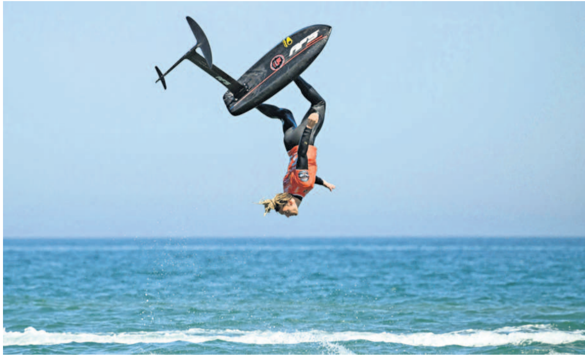
MAKING WAVES: A surfer competes in the final of Mondial du Vent competition at La Franqui in France.