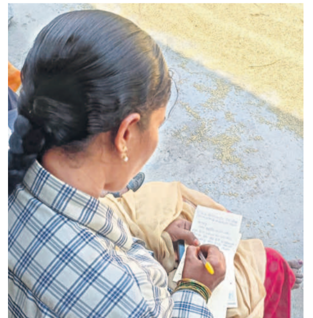
A farmer writing a postcard to Chief Minister A Revanth Reddy.