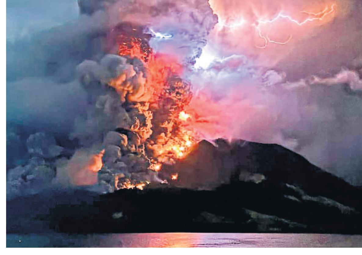
ON HIGH ALERT: Mount Ruang spewing hot lava and smoke as seen from Sitaro, North Sulawesi. The volcano erupted several times in Indonesia's outermost region overnight, forcing hundreds of people to be evacuated.