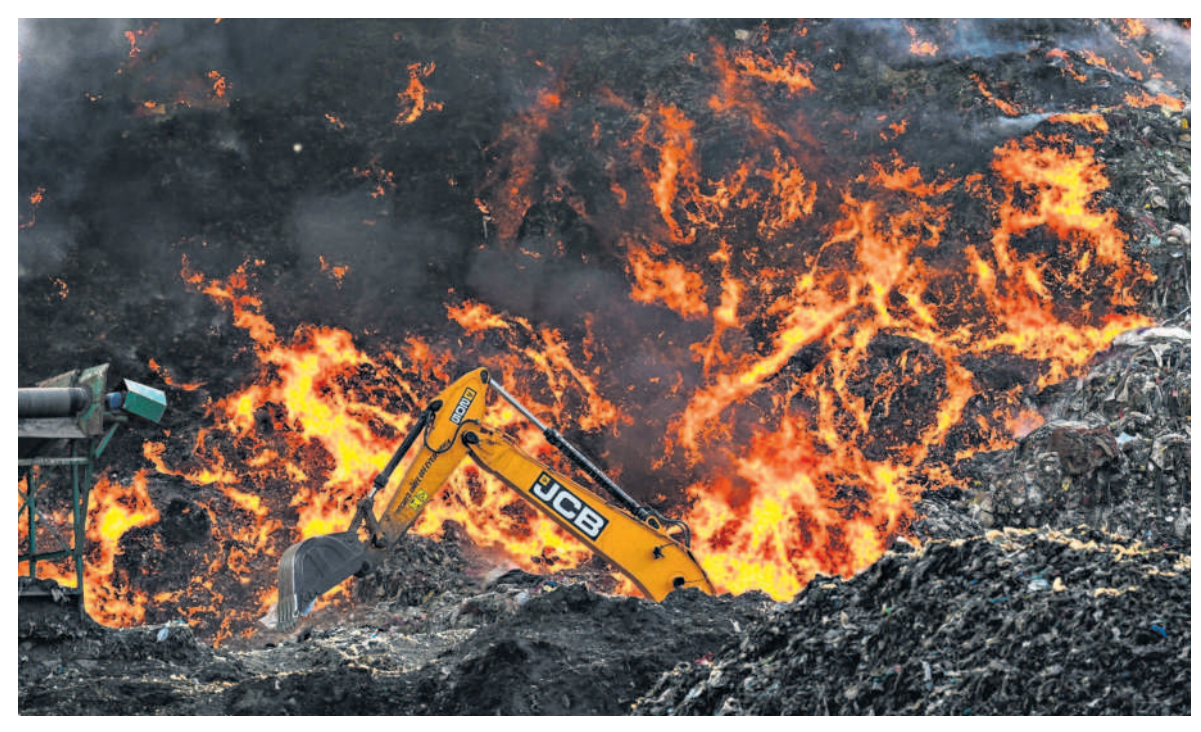
SUMMER EFFECT: Fire breaks out at the Ghazipur landfill site, in New Delhi on Sunday, Municipal Corporation of Delhi officials said excavators were pressed into service to control the fire.

Cong will not even leave mangalsutra : PM