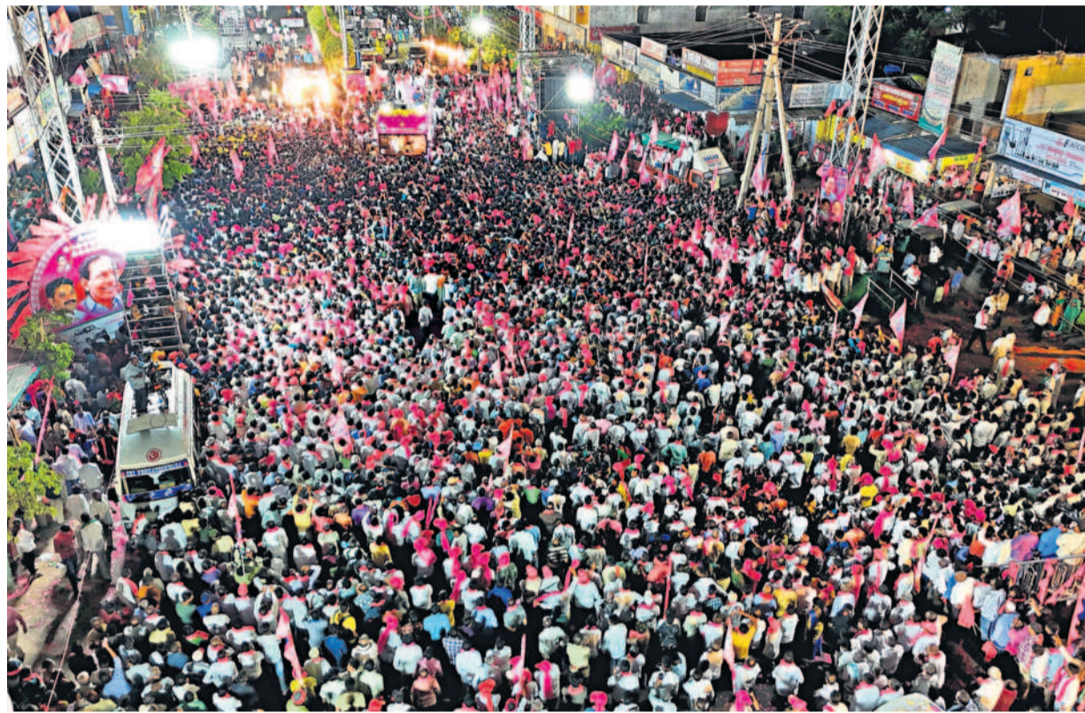
BRS chief K Chandrashekhara Rao addressing a massive crowd at Bhongir on the second day of his bus tour on Thursday.

Attacks it on depreciating rupee, jobs, atrocities against women