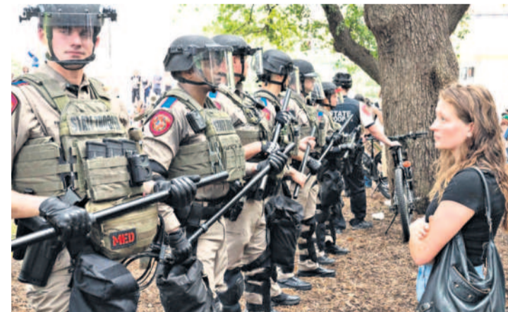
A student stares at a row of Texas State Troopers during the protests on the campus of the University of Texas in Austin.

Columbia continued to negotiate with students after several failed attempts — and over 100 arrests — to clear the encampment, but several universities ousted demonstrators on Wednesday, swiftly turning to law enforce-