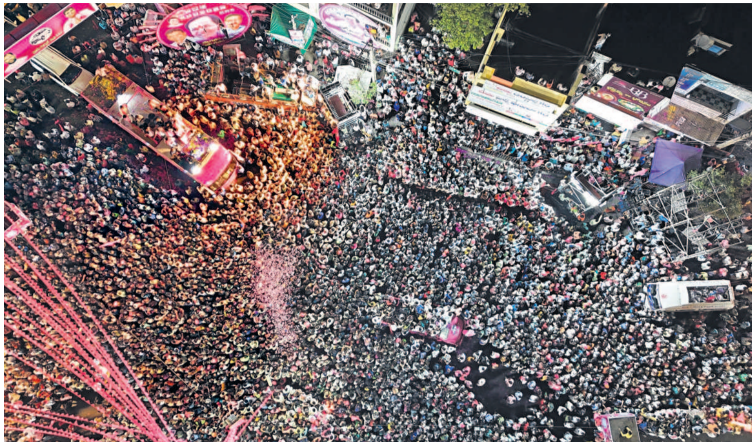
A section of the crowd during Leader of Opposition and BRS president K Chandrashekhara Rao's road show at Dr BR Ambedkar junction in Khammam on Monday.

Questions silence of Congress, BJP on Centre's plans on Godavari water