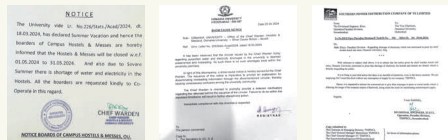
Notice issued by the OU Chief Warden ordering closure of hostels and mess facilities, show cause notice issued by the Registrar to the Chief Warden seeking an explanation and SPDCL letter claiming there is no shortage of power supply.