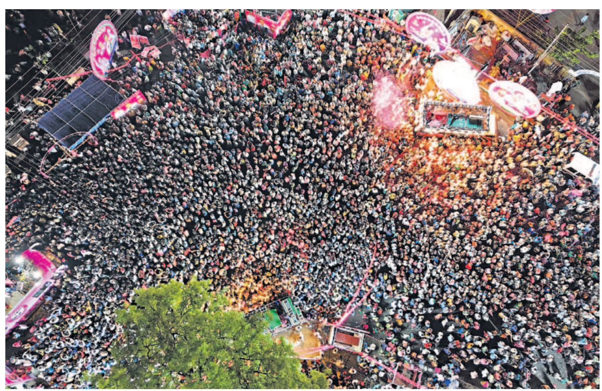
A section of the crowd during BRS chief K Chandrashekhar Rao's road show in Kothagudem on Tuesday

KCR slams Congress govt, says BRS will oppose any such move