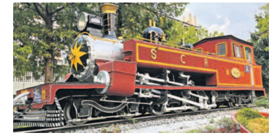
The steam locomotive engine.