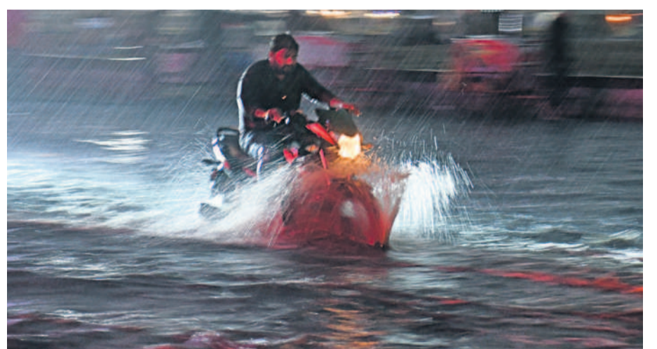
A biker makes his way amid rain on a waterlogged road in the city on Tuesday.

The rains left a trail of destruction across agricultural fields, where mango crop was damaged in several acres, while paddy brought for procurement at purchase centres was drenched in several areas. Power supply disruptions were also reported across the State as the winds uprooted trees and electric poles. The climate changed suddenly after noon at several places and overcast conditions were witnessed. (SEE PAGES 2, 4)