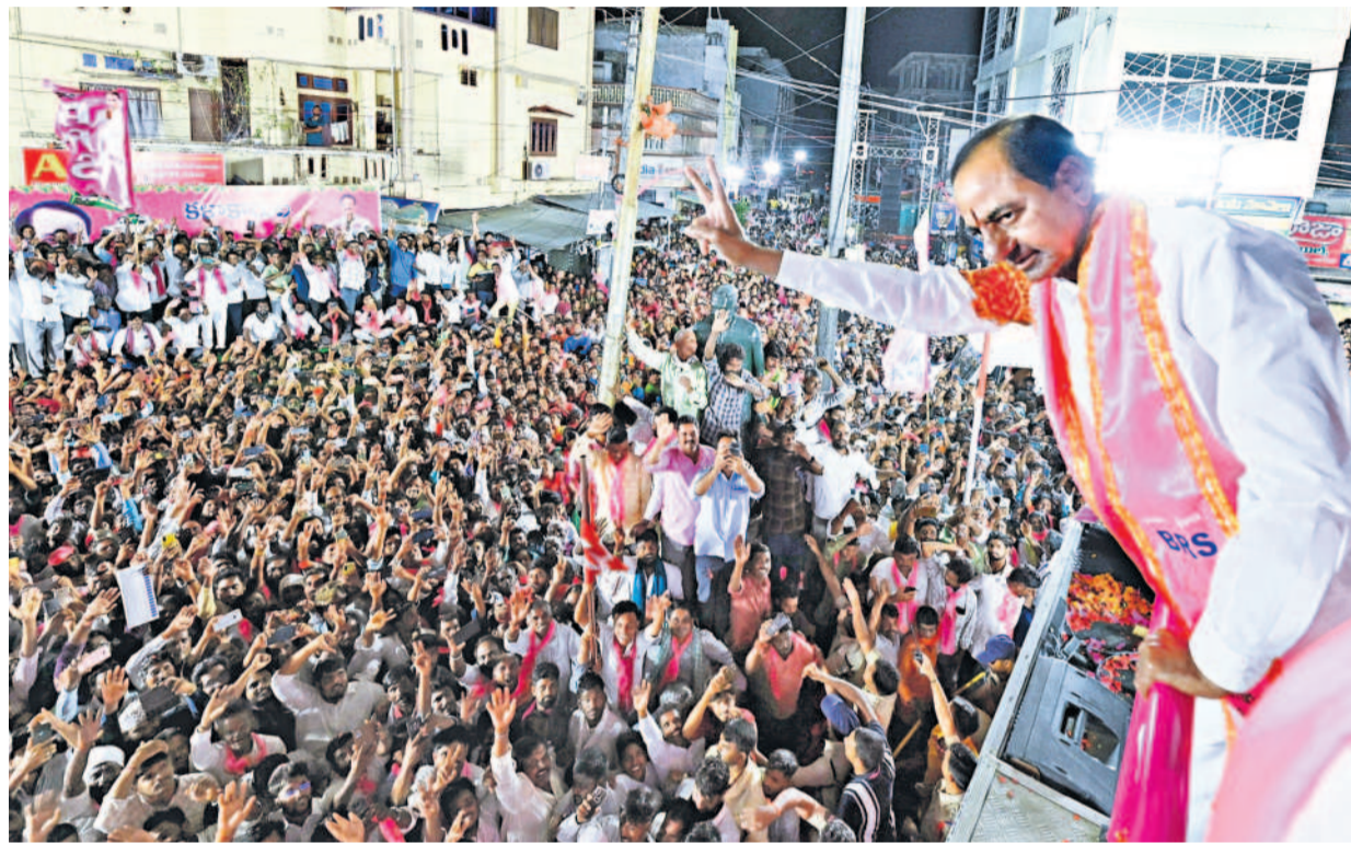
Leader of Opposition and BRS chief K Chandrashekhara Rao during a roadshow in Kamareddy on Tuesday.

Predicting the emergence of a coalition government at the national level, with significant roles for the BRS and other regional parties, he hinted at a decline in