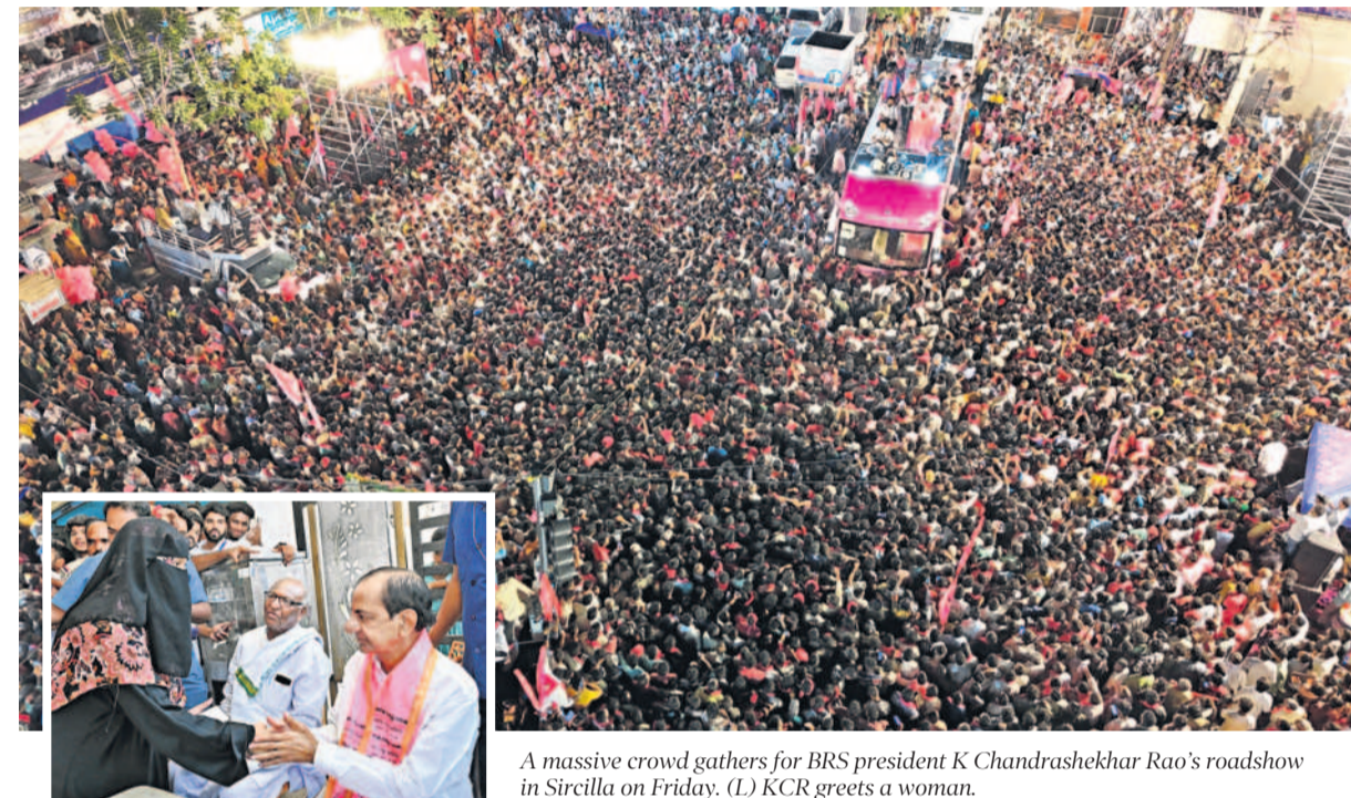
A massive crowd gathers for BRS president K Chandrashekhara Rao's roadshow in Sircilla on Friday. (L) KCR greets a woman.

Bubble of NDA & Modi mania has burst, says KCR