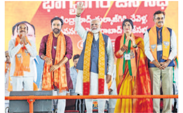
PM Narendra Modi with BJP candidates during a public meeting in Hyderabad on Friday.