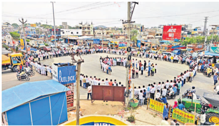
BRS cadre block a road during the State-wide protest, in Mahabubnagar on Thursday.

They highlighted its failure to procure paddy at Minimum Support Price (MSP) and alleged that the Congress came to power by making promises but took