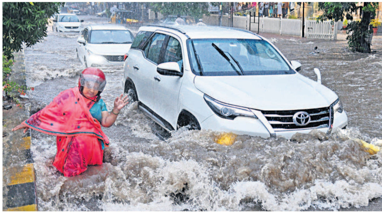
A woman motorist wades through knee-deep water after passersby helped her with her two-wheeler, which got stuck on a flooded road in Himayatnagar, after heavy rain lashed Hyderabad on Thursday.