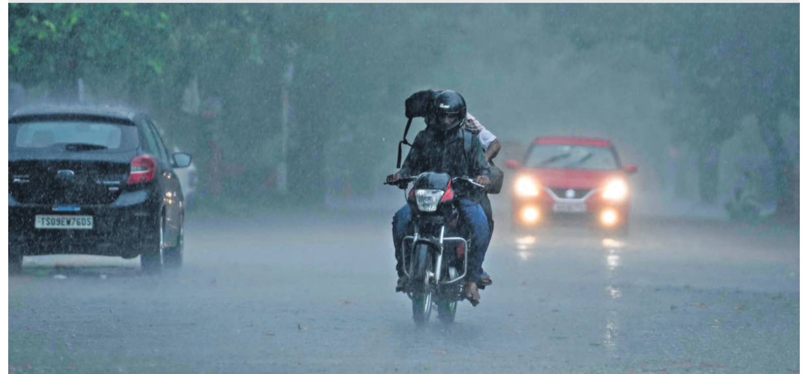
A biker makes his way amid heavy rain in Hyderabad on Saturday. Following a brief respite from intense rain on Friday, Hyderabad was hit by a downpour and thunderstorm on Saturday afternoon, leading to extensive disruptions and flooding in low-lying areas. (REPORT PAGE 3)