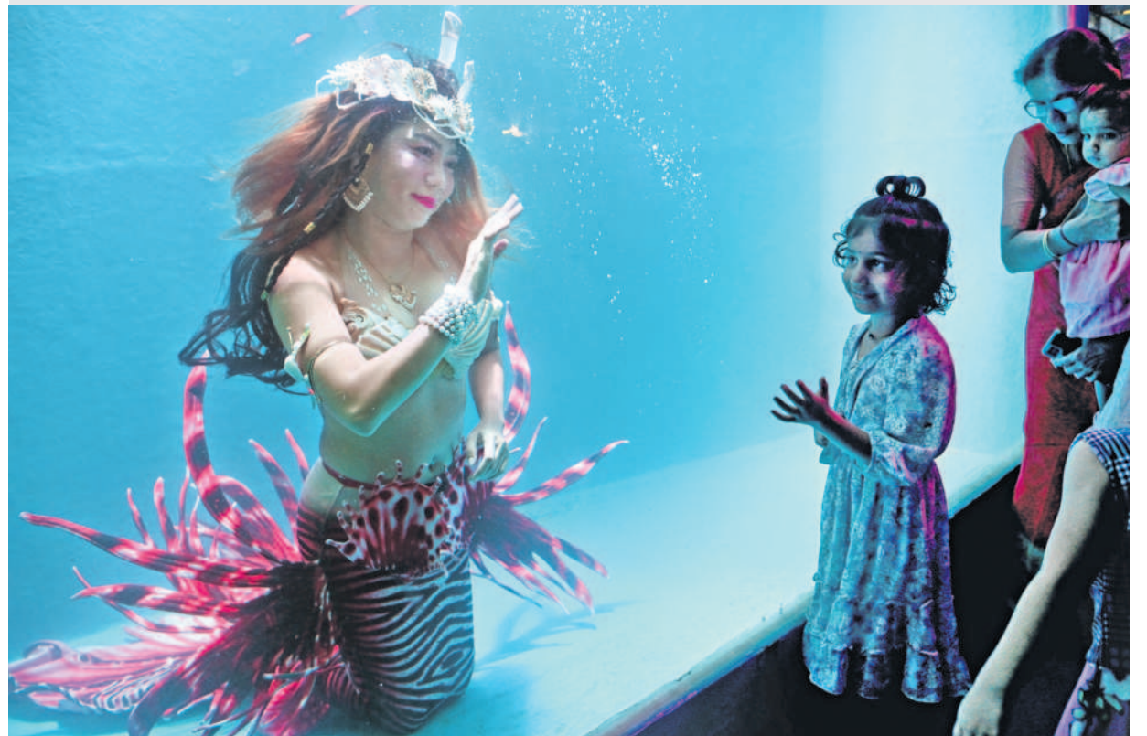
Children enjoy a mermaid show at Underwater Tunnel exhibition at Kukatpally in Hyderabad on Tuesday. According to organisers, the exhibition features the country's first-ever scuba diving experience along with a special mermaid show featuring performers from Spain. The show will be open for public from 11 am to 10 pm.