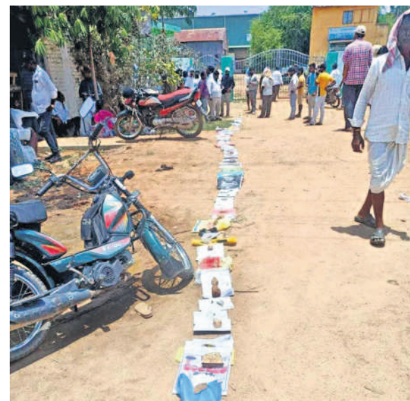
Farmers place pattadar passbooks for their turn to collect tokens to buy green manure seeds, at Jogipet on Tuesday.

The irate farmers took to the roads and staged a protest on the busy road blocking traffic for a while. This led to a massive traffic jam on the busy NH-161. (SEE PAGE 2)