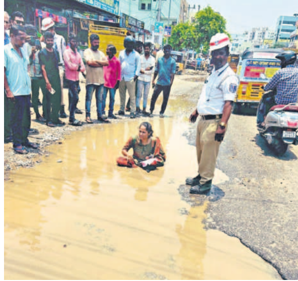
The woman registering her protest by sitting in a waterlogged pothole at Nagole in Hyderabad on Thursday.

Speaking to media soon after, the woman lamented that her children fell into those potholes a couple of times. "This is not just today, we face this problem every day. I have counted; there are 30 potholes on this road. We just want this fixed," she said, adding that she spoke to the Commissioner, who told her that a budget was allocated. She asked for a timeline for when the work would be completed.