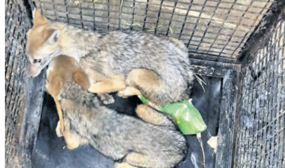
The jackals, which were rescued from the agricultural well, at Shahapur village on the Telangana-Maharashtra border.