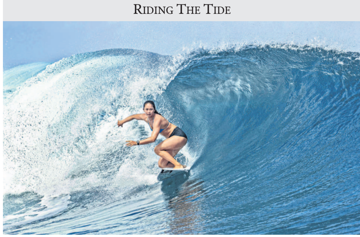
A Hawaiian surfer trains for the WSL Tahiti Pro competition in Teahupo'o, on the island of Tahiti, French Polynesia.

Indian film scripts history Filmmaker Payal Kapadia and movie's cast get standing ovation