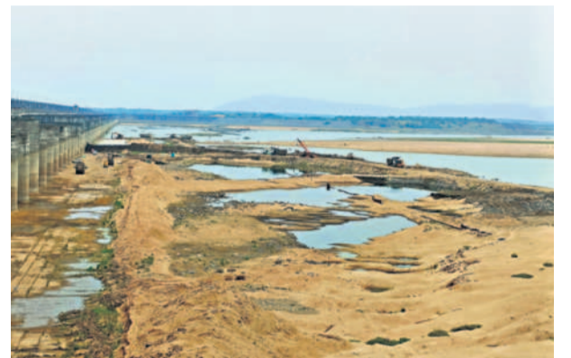
Irrigation officials say the sinking of barrage pillars was a minor occurrence and the project remains safe.

They are of the opinion that the barrage could be put to use by taking up sand and cement grouting to fill the gaps caused due to dislocation of underground soils beneath the raft system. The L&T, which has been engaged for the imple-