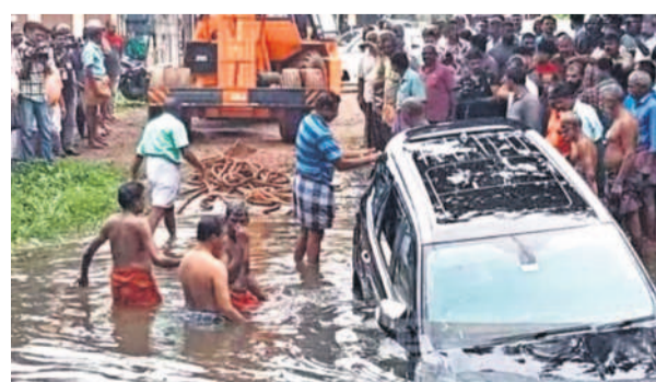
The four-member group, including a woman, was going towards Alappuzha in Kerala when the incident occurred.