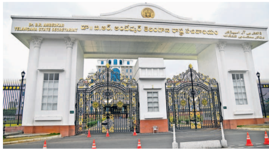
The main entrance of BR Ambedkar Telangana Secretariat which was closed on Monday.