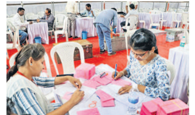
Polling officials carry out preparations at a counting centre in Nagpur on Monday.