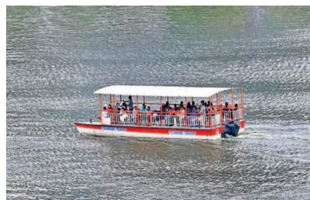
People take a boat ride at Durgam Cheruvu on a cloudy afternoon in Hyderabad on Monday.

While the advent of southwest monsoon in Telangana is usually associated with second-half of June, the Indian Meteorological Department said: “Southwest Monsoon advanced into some parts of Central Arabian sea, some parts of Karnataka, Rayalaseema, Coastal AP, some parts of Telangana and