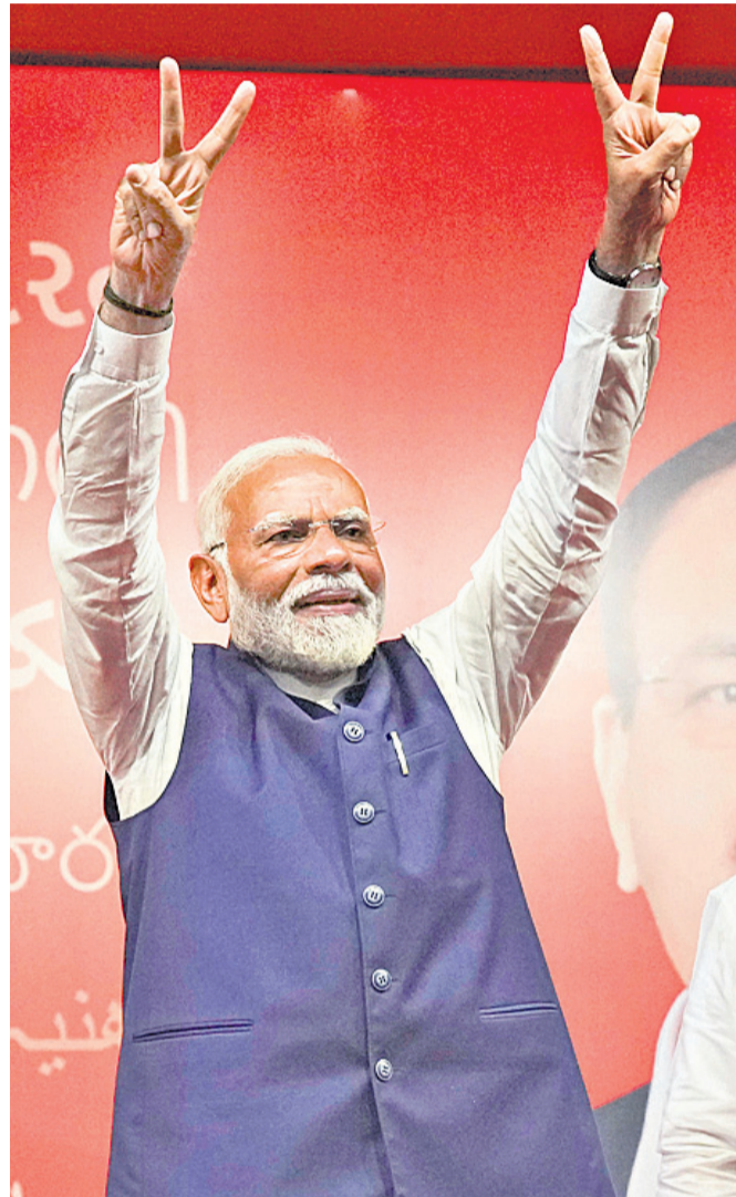
Prime Minister Narendra Modi at the BJP headquarters in New Delhi on Tuesday.

The elections also highlighted the revival of the main opposition Congress party under Rahul Gandhi, and the unexpected role of the Samajwadi Party in Uttar Pradesh — under Akhilesh Yadav — as a giant slayer. The trends and results did not throw up a landslide victory the NDA had hoped for and what was projected by the exit polls. (SEE PAGE 2)