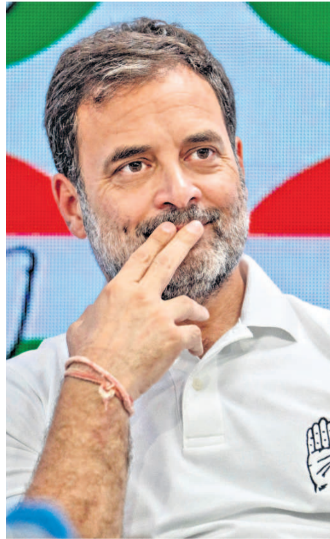
Congress leader Rahul Gandhi addressing the media at the party headquarters in New Delhi on Tuesday.