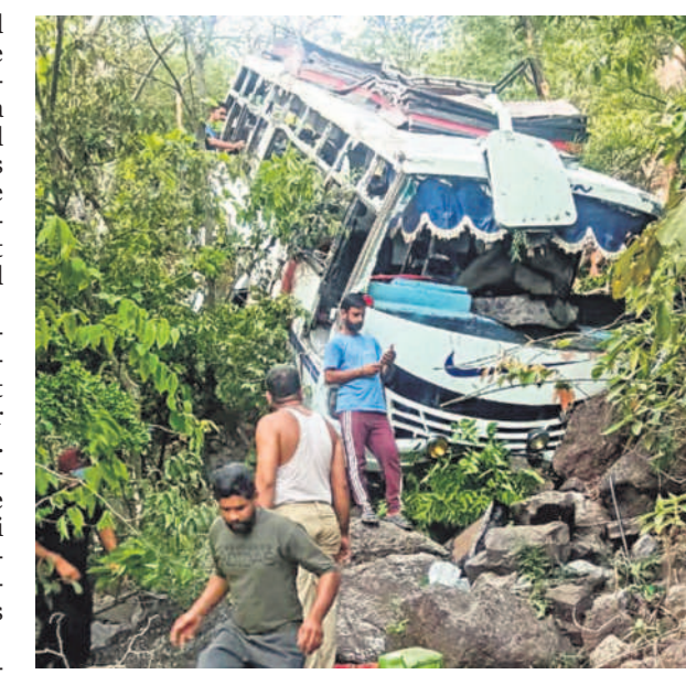
The damaged bus after it plunged into a gorge following the

Eyewitnesses shared harrowing accounts of the ter-