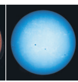
Images captured by SUIT and VELC instruments show dynamic activities of the Sun during May 2024.

with Coronal Mass Ejections (CMEs), leading to significant geomagnetic storms, were recorded," it