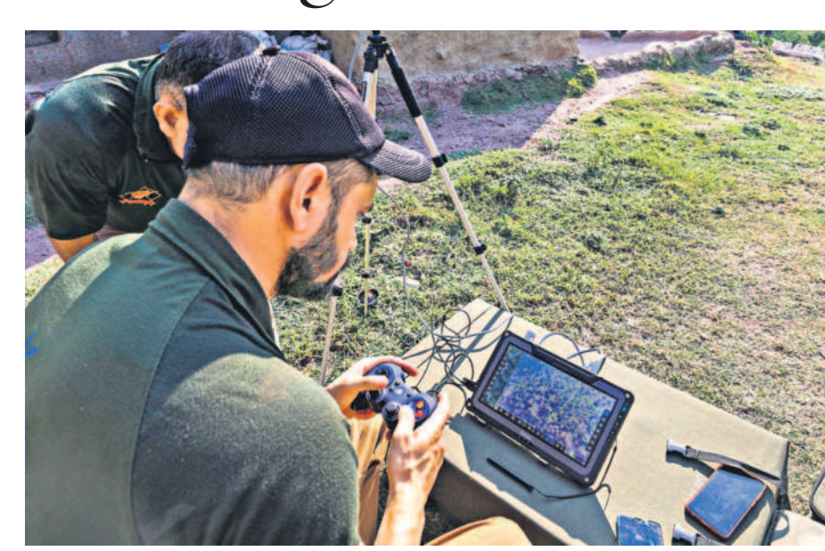
Security personnel conduct search operation using drone after a bus carrying pilgrims was ambushed by terrorists, in Reasi district of Jammu and Kashmir, on Monday.

A massive manhunt is underway for three foreign terrorists, possibly of the Lashkar-e-Taiba, responsible for the deadly attack on pilgrims in Jammu and Kashmir's Reasi that resulted in the loss of nine lives, including a two-year-old, officials involved in the investigation said on Monday.