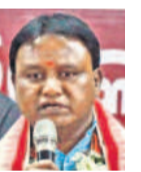
Mohan Charan Majhi new Chief Minister of Odisha, where the saffron party came to power for the first time with a clear mandate in Assembly elections, ending the 24-year stint of BJD.