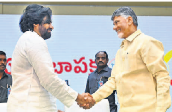
Andhra Pradesh Chief Minister-designate N Chandrababu Naidu greeting Jana Sena chief Pawan Kalyan on Tuesday.

"Even after 10 years we are not in a position to say where is our State capital," he said, slamming the previous government of YSR Congress Party for putting a halt to the development of Amaravati as the State capital. In 2019, the Jagannathan Reddy-led government reversed the decision by the