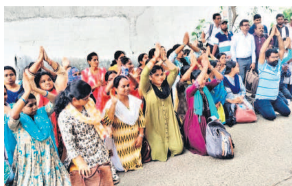
Teacher job aspirants staging a protest by kneeling at the residence of Chief Minister A Revanth Reddy on Tuesday.

Around 200 teacher job aspirants from across the State reached the Chief Minister's residence hoping to present their issue and seek a resolution. However,