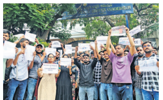
AEE job aspirants staging a protest at TGPSC demanding release of the final result and appointment orders.

Aspirants lamented that despite two months into completion of verification for certificates, the commission did not publish the final selection list. Even the merit list was released only after they submitted several representations, the protesters said, adding they had to move the court to resolve