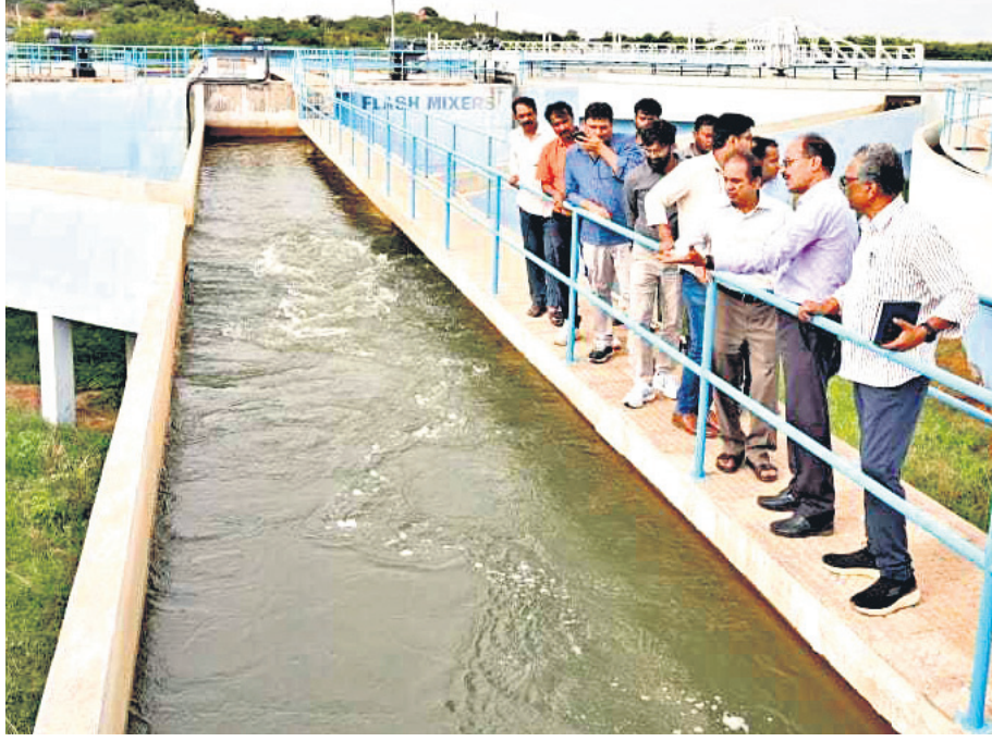
The Yellampally project, located on the banks of the Godavari, is left with live storage of just 4.21 TMC, of which around 168 million gallons per day will be supplied to the city.

is left with live storage of just 4.21 TMC of water, of which around 168 million gallons per day (MGD) will be supplied to the city. A total of 20 pumps have been installed at the Murmur site to undertake this emergency pumping. While only seven are being used, others will