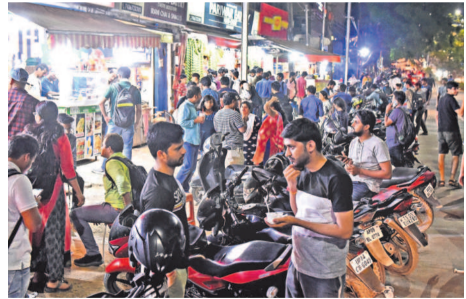
The Hyderabad Police has directed commercial establishments to close down business between 10.30 pm and 11 pm every day.