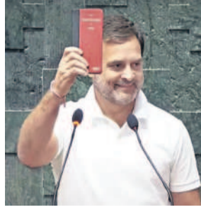
NATION | PAGE 07 Rahul Gandhi to be Leader of Opposition in Lok Sabha