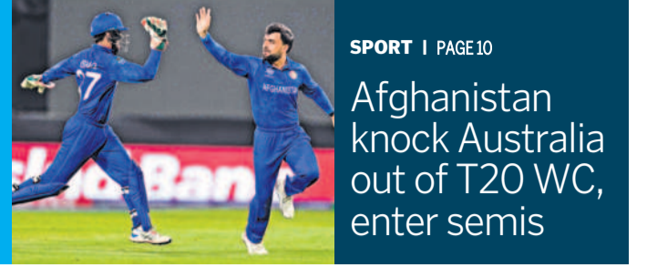
SPORT | PAGE 10 Afghanistan knock Australia out of T20 WC, enter semis