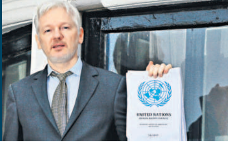
WORLD | PAGE 09 WikiLeaks founder Julian Assange freed from prison WikiLeaks founder to plead guilty to violating Espionage Act