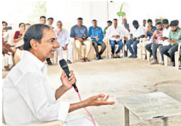
BRS president K Chandrashekar Rao addressing supporters at his Erravelli residence on Thursday.

Chandrashekar Rao said under the BRS rule, Telangana was a model State, excelling in the areas of electricity, water, drinking water and agriculture. He