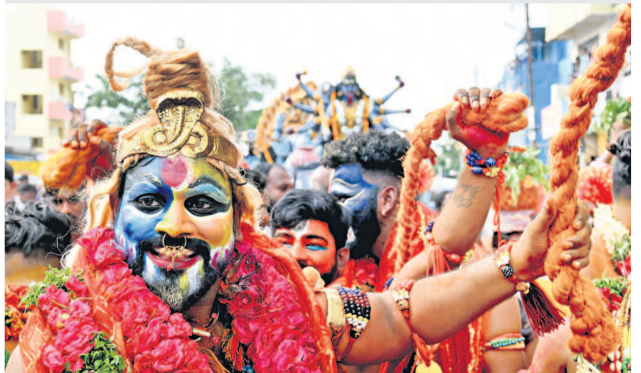
A Potharaju at the Golconda Bonalu festivities, which commenced in Hyderabad on Sunday. (REPORT PAGE 2)