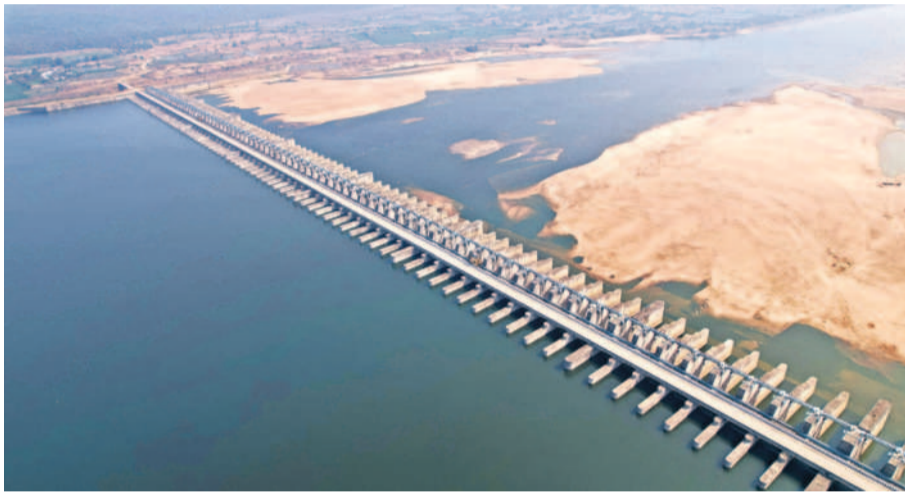
The multi-stage project involves several pumping facilities. It has in all 35 units that manage the project's outflows at the Medigadda, Annaram and Sundilla barrages.

Since no impounding of water is allowed at this stage in the Medigadda barrage, the possibility of lifting from the natural flows has been