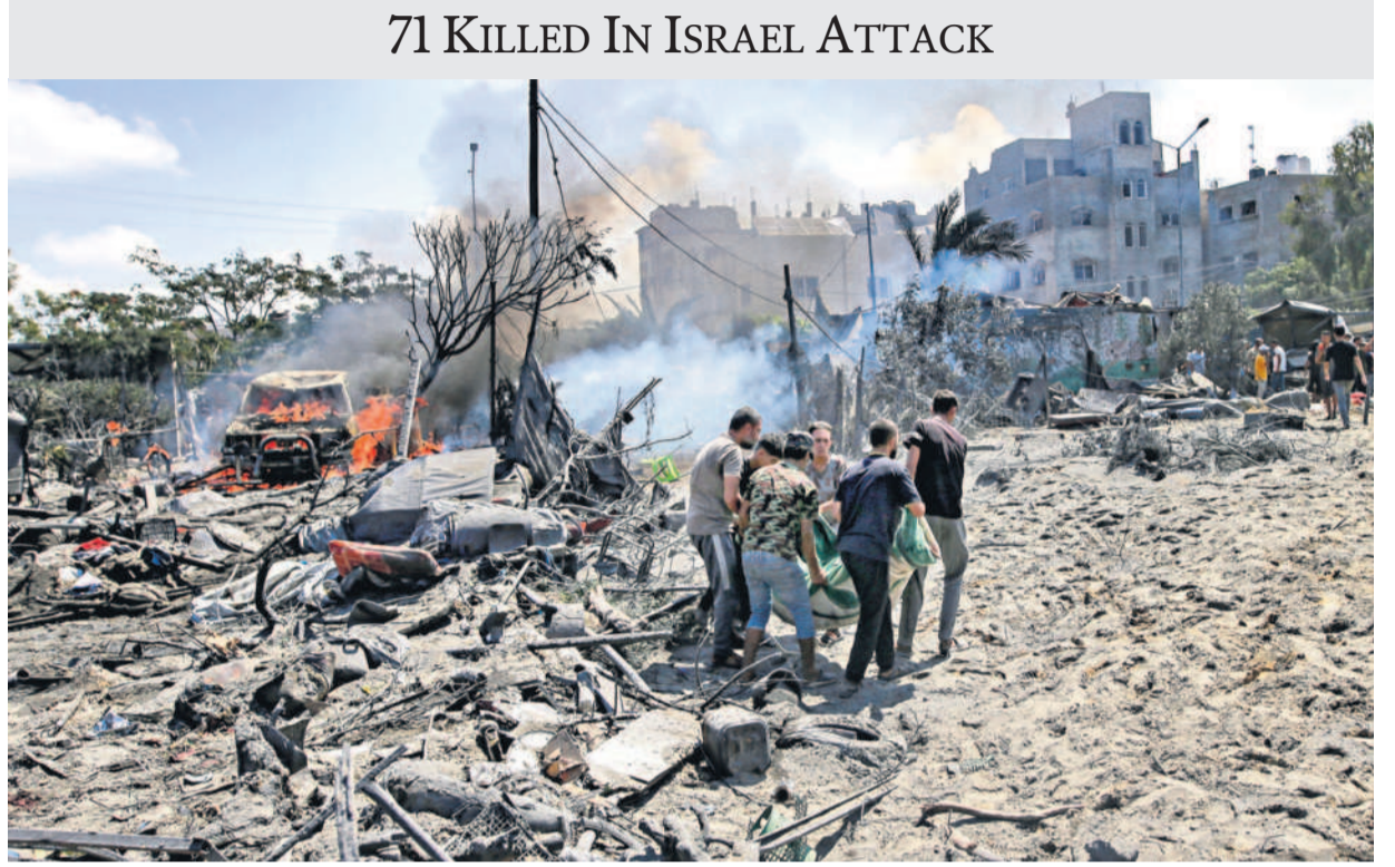
71 KILLED IN ISRAEL ATTACK

Pointing out that Modi was bowing to pressure from Naidu on account of the TDP's support to the NDA, the BRS demanded the eight BJP MPs from the State to spell out their stance. Addressing a press