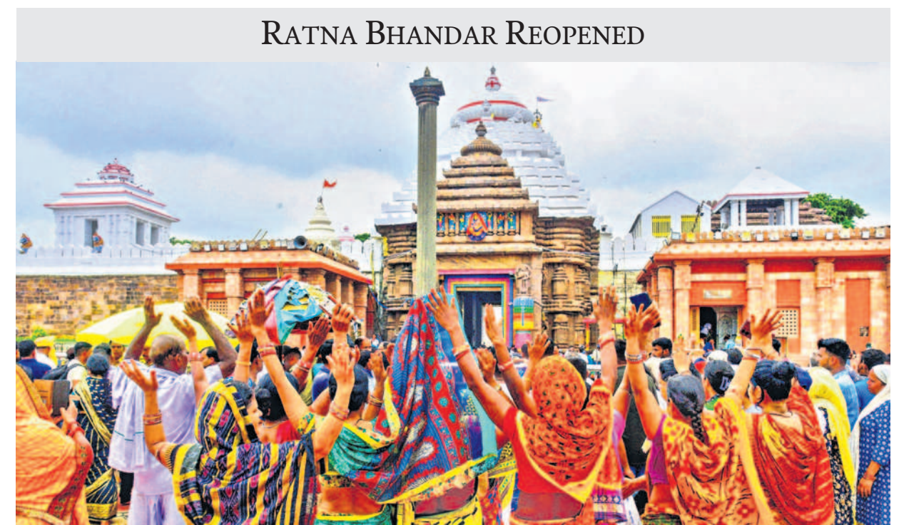
Devotees during the reopening of 'Ratna Bhandar' at the Jagannath Temple, in Puri on Sunday. According to officials, the revered treasury of the 12th-century temple, was reopened after 46 years for an inventory of valuables and the repair of its structure. No snakes were found as was believed. (REPORT PAGE 7)