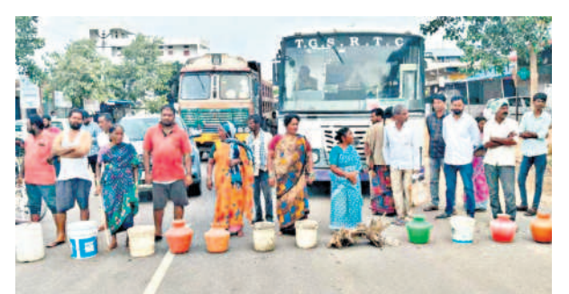
Residents of Gavvalapally staging a rasta-roko on the Medak-Chegunta road on Sunday.

Stating that officials and elected representatives were not responding to their pleas, the villagers blocked the road on Monday morning, pointing out that the village was not getting water for a fortnight, disturbing normal life. They