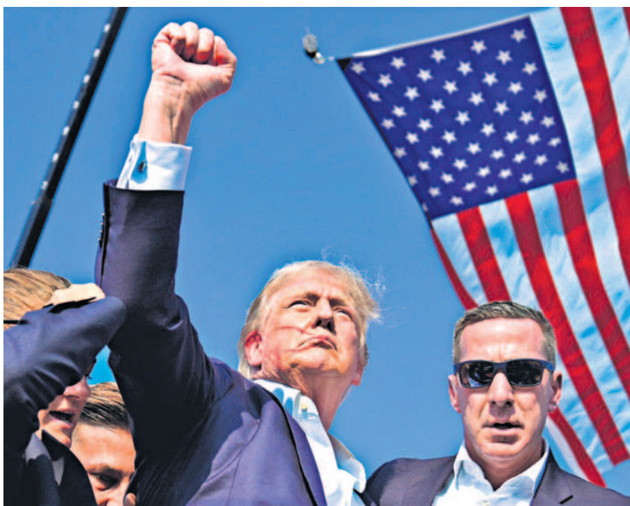
Republican presidential candidate Donald Trump reacts as he is surrounded by US Secret Service agents after the shooting incident, at a campaign rally in Pennsylvania.

Donald Trump survived an attempt on his life when a young gunman fired multiple shots at the former US President at a campaign rally in Pennsylvania, injuring his right ear. Trump, 78, was addressing his supporters at the packed outdoor election rally in Butler town on Saturday when bullets started flying. Video footage showed him grabbing his ear as shots were fired. Trump was seen with blood on his ear and cheek as he was rushed off the stage by Secret Service agents.