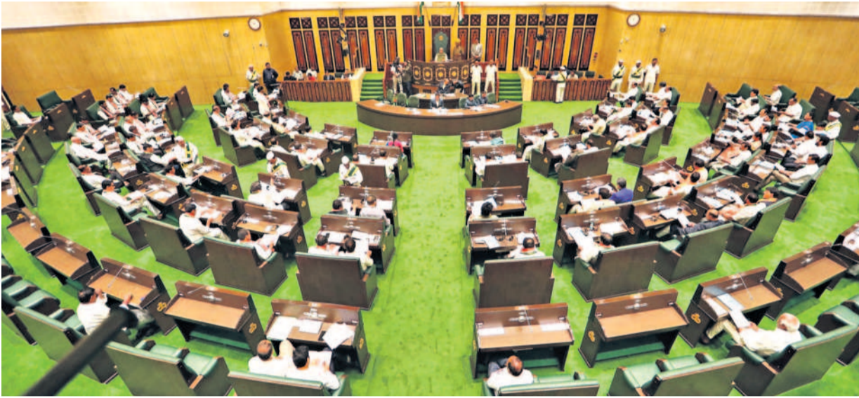
Members attending the Budget session of the Telangana Legislative Assembly in Hyderabad on Thursday.

This amount equals to half of the State's own tax revenue estimated at Rs 1,38,181.26 crore and highlights the growing dependency on borrowings. Ironically, Deputy Chief Minister and Finance Minister Mallu Bhatti Vikramarka attempted to blame the previous BRS regime for obtaining huge loans, saying that this was forcing the current Congress government to allocate most of the funds for repayment. Breaking down the debt further, the Budget indicates that Rs 57,112.48 crore will be from open markets, Rs 3,900 crore from the Central government, Rs 1,000 crore from other sources, Rs 4,000 crore from deposit transactions, and Rs 3,560 crore from loans and advances. The projected revenue receipts stand at Rs 2,21,242.23 crore, including Rs 1,38,181.26 crore from tax revenue, Rs 26,216.38 crore from the State's share in Central taxes, Rs 35,208.44 crore from non-tax revenue, and Rs 21,636.15 crore from Central grants. Of the total Budget, Rs 2,20,944.81 crore has been allocated for revenue expenditure, with Rs 17,729.77 crore set aside for interest on loans. Only Rs 33,486.50 crore, a