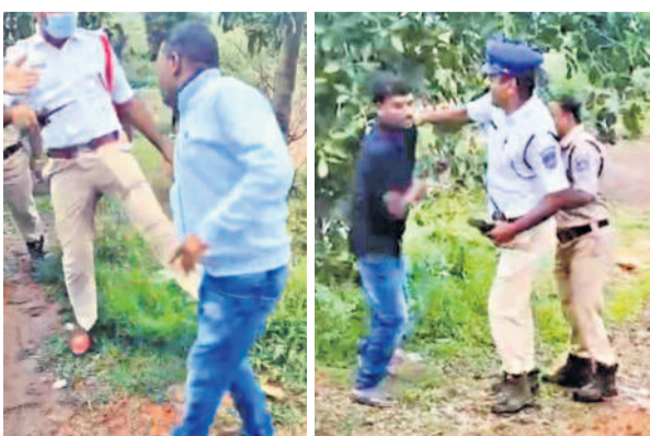
A screening grab of the video showing traffic police officials thrashing two men.

In a shocking incident, two men were publicly thrashed by a traffic police official and a constable at Chevella. A video of the incident went viral on various social media platforms after some persons who filmed the police high-handedness posted it online. The action of the traffic police drew widespread criticism, which came just a week after a Sub Inspector assaulted a truck driver at Jeedimetla. In the video, the traffic police official is seen walking up towards three men standing on the roadside and hitting one of them. The official pulled up the man by his collar and later kicked him in full public view.