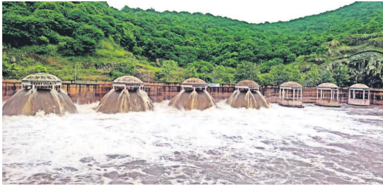
Water gushes out of the Nandi Medaram pumphouse to which water was released through the gravity canal from the Sripada Yellampalli reservoir on Saturday.

In a swift turnaround of developments, the State government came out with an assurance that the pumping operations under the