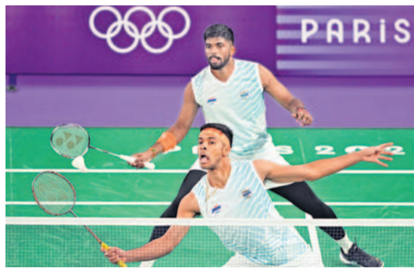
India's Satwiksairaj Rankireddy and Chirag Shetty in action against Indonesia's Fajar Alfian and Muhammad Rian Ardianto.