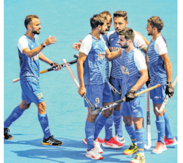
India's captain Harmanpreet Singh celebrates with teammates after scoring a goal against Ireland on Tuesday.

Harmanpreet (13th and 19th minutes) struck once each in the first two quarters, while the second half remained goal-less despite