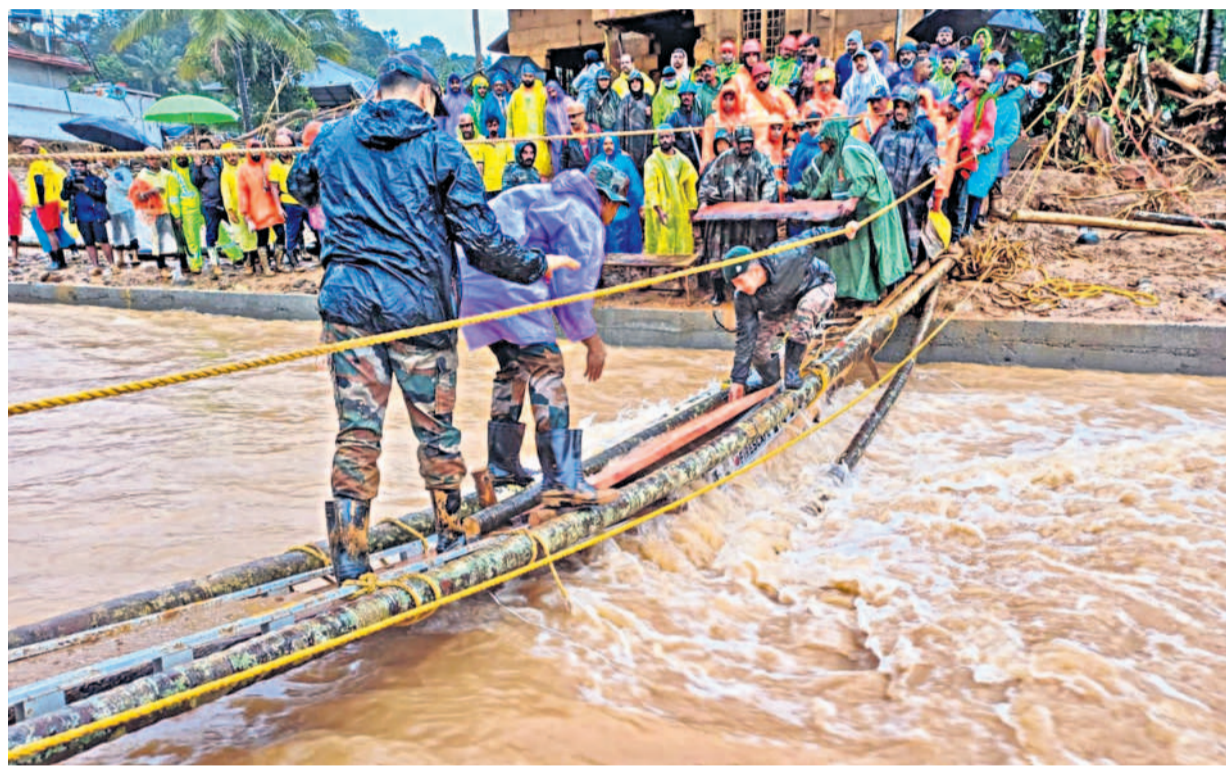
Rescue operations under way following landslides triggered by heavy rain at Chooralmala in Wayanad on Wednesday.

People in low-lying areas told to evacuate as rains lash region