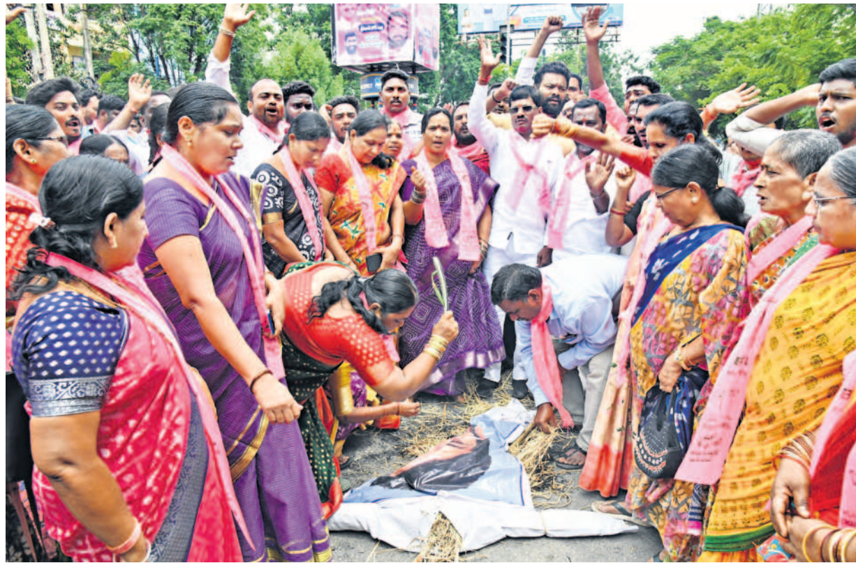
BRS activists stage a protest against Chief Minister A Revanth Reddy, at Siddipet on Thursday.