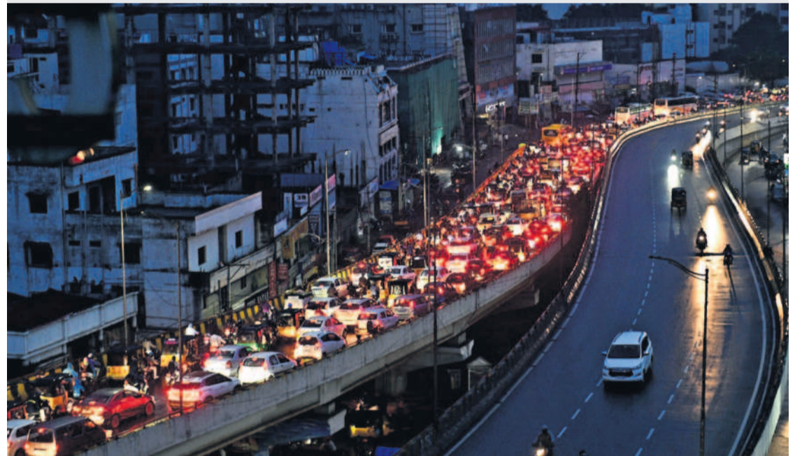
Traffic crawls at a snail's pace following heavy rain at Tolichowki on Monday. Hyderabad witnessed heavy rains causing traffic chaos, with commuters caught in knee-deep water and gridlocks. (REPORTS PAGE 3)