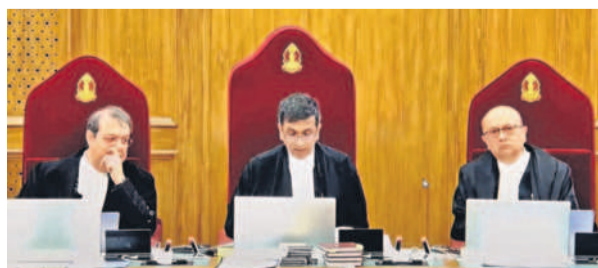
Bench comprising CJI DY Chandrachud, Justice JB Pardiwala and Justice Manoj Misra at the Supreme Court in New Delhi.

Termining the incident as "horrific", the apex court excoriated the State government over the delay in filing the FIR and allowing thousands of miscreants to vandalise the State-run fa-