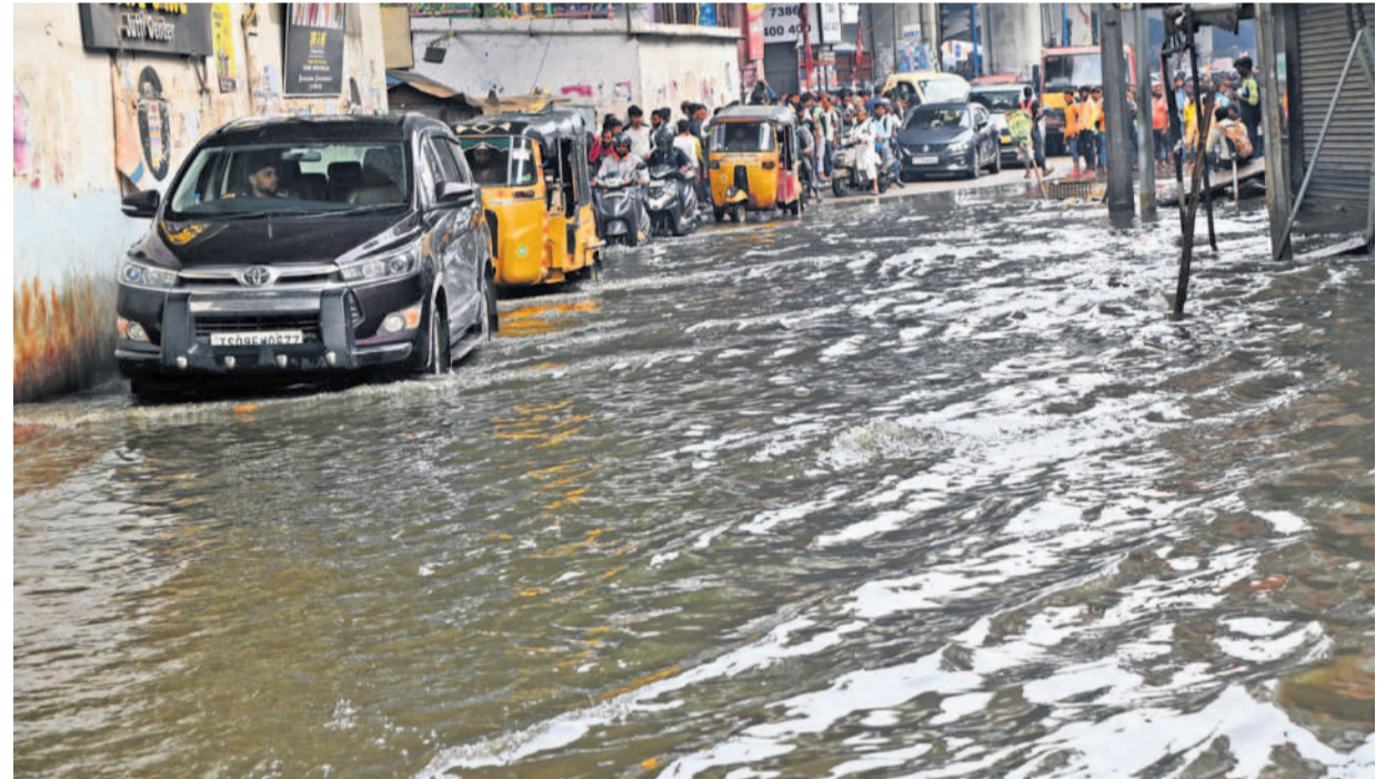
Vehicles make their way through a waterlogged road at Tolichowki in Hyderabad on Tuesday.

The residents of Nizampet, Kukatpally, Kondapur, Punjagutta and other neighbourhood areas said the thunderous sounds jolted them out of their sleep, while some likened it to an earthquake. In Punjagutta, an apartment bore the brunt of the storm, with the lightning strike reportedly demolishing the building's