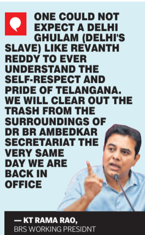
— KT RAMA RAO, BRS WORKING PRESIDENT

Monday with the Congress government's decision to install Rajiv Gandhi's statue in front of the Secretariat, to which BRS and different sections of society raised objections, pointing out that the same location was already marked for the installation of a Telangana Thalli statue.