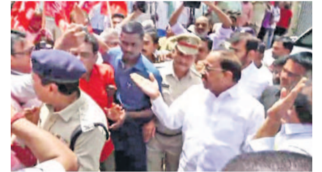
Minister Tummala Nageswara Rao argues with a farmer for shouting slogans, at the District Collectorate in Khammam.