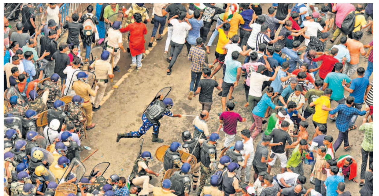
RAF personnel lathi-charge activists of the Paschimbanga Chhatra Samaj during the protest march to 'Nabanna' in Howrah.

Several protestors, cops injured; over 200 people arrested