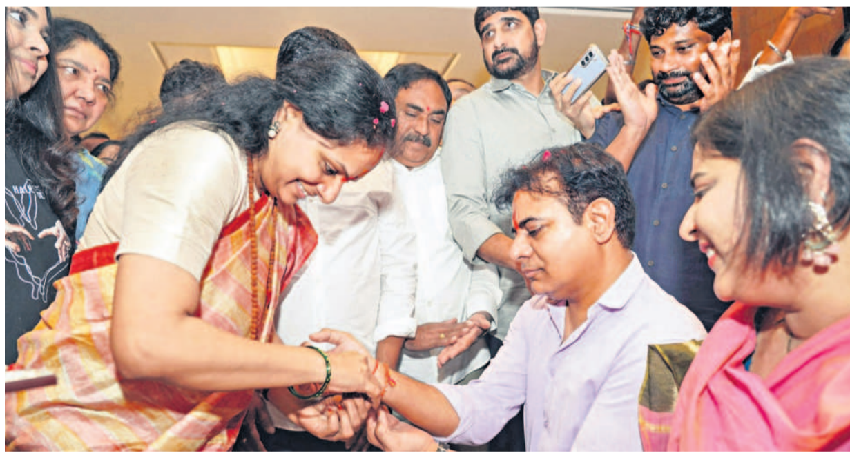
BRS MLC K Kavitha ties a rakhi to her brother and BRS working president KT Rama Rao on her arrival in Hyderabad on Wednesday.

Kavitha was greeted by thousands of jubilant party activists holding placards that read 'Daughter of a Fighter', 'Satyameva Jayathe' (truth prevails) and 'Justice Has Won'. The atmosphere was electric as supporters cheered and celebrated her return. (SEE PAGE 2)