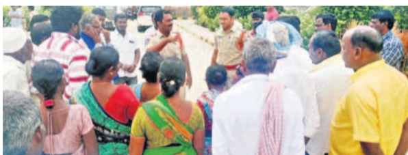
Dalits from Shivaru Venkatapur complaining to the Markook police, in Siddipet district on Wednesday.

The dalits approached the Markook police, seeking action against those who pre-