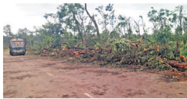
The Forest Department said more than 50,000 trees may have collapsed in the Tadvai-Eturnagaram forest areas.

STATE BUREAU Hyderabad Worried over an unusual phenomenon that led to widespread destruction across 500 acres in the Tadvai-Eturnagaram forest areas, with thousands of trees being uprooted or destroyed, the Forest Department is roping in experts from different departments, including the National Remote Sensing Centre (NRSC) and Meteorological Department, to study and ascertain the reasons. As per preliminary estimates, the department said