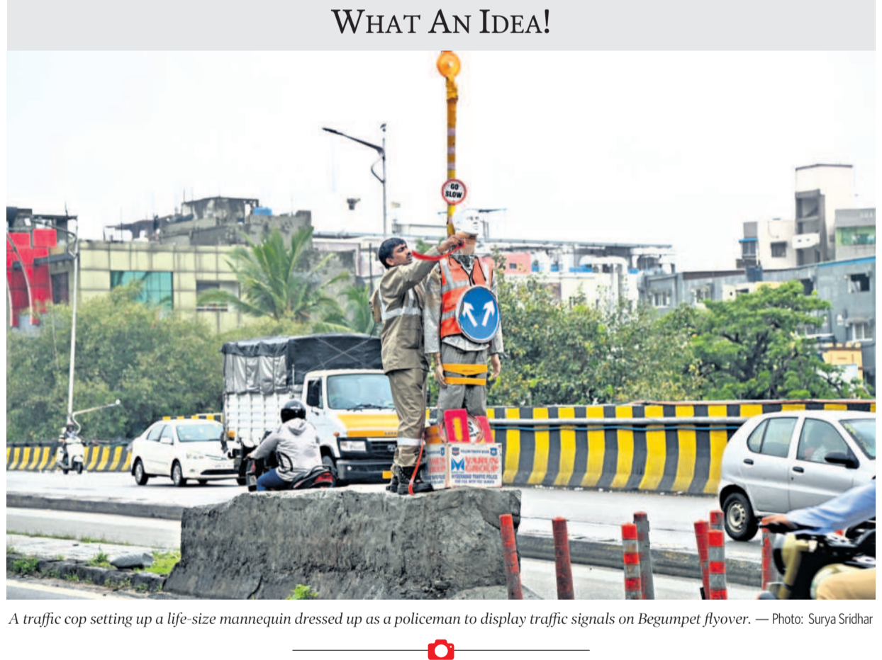
A traffic cop setting up a life-size mannequin dressed up as a policeman to display traffic signals on Begumpet flyover.