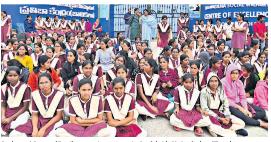
Students of Centre of Excellence staging a protest in Gowlidoddi, Hyderabad, on Thursday.

Having produced several international and national players from marginalised sections in the last one decade, the Telangana Social Welfare Residential Educational Institutions Society (TGSWREIS) sports academies are now facing a crisis. Courtesy, the Congress government discontinuing the services of all sports coaches in academies run by the society. For the past several years, these coaches have been pillars of the academies, transforming raw and young talent into top-notch performers. Their training and expertise guided several young athletes to success, earning medals on the national and global stage and bringing laurels to the State and the country. The society runs 28 sports academies, which were established by the previous BRS government, to create elite athletes from the marginalised and downtrodden sections. (SEE PAGE 2)