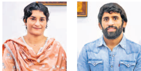
Wrestlers Vinesh Phogat and Bajrang Punia joined the Congress in New Delhi on Friday.