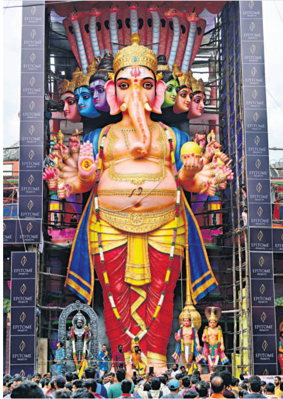
The Khairatabad Ganesh idol has been installed and all preparations have been made at the pandal for the Ganesh Chaturthi festival on Saturday. (REPORTS PAGE 3)