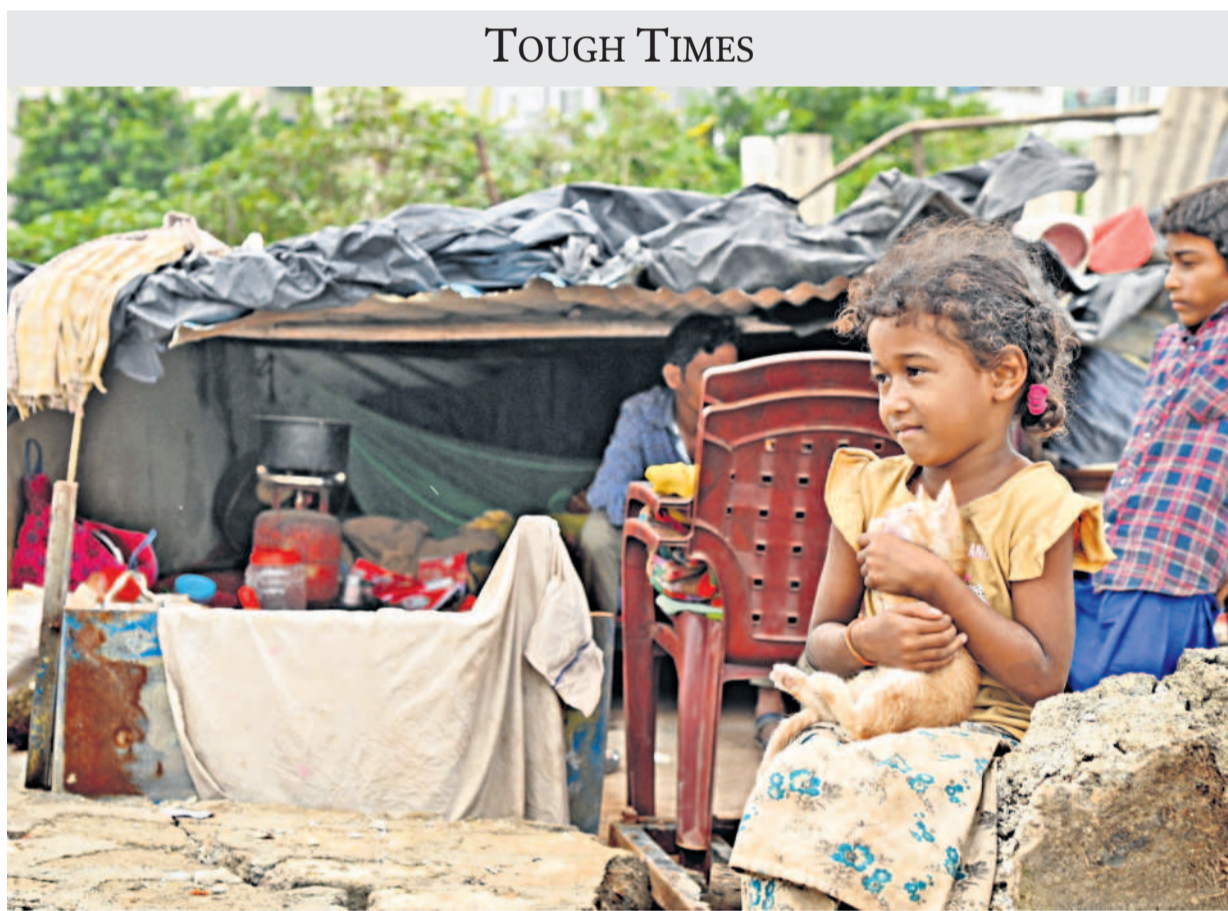
A girl, whose family was displaced after her house was razed during the recent HYDRABAD demolition drive, plays with a cat at Sunnam Cheruvu in Madhapur, Hyderabad, on Wednesday.