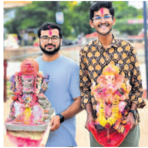
HYDERABAD | PAGE 02 Bappa's immersion begins on a colourful note