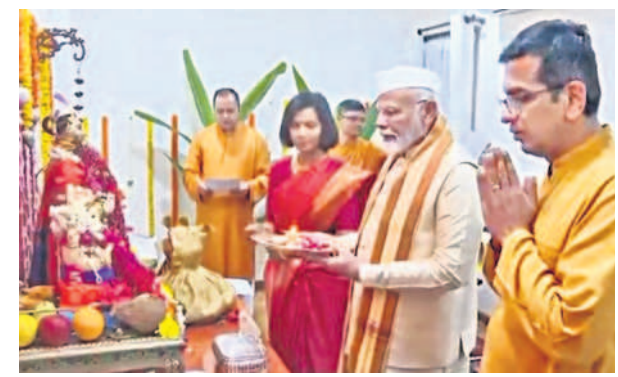
PM Modi participating in the Ganpati Puja at CJI DY Chandrachud's residence in New Delhi on Wednesday.

Addressing a press conference at the BJP headquarters here, Lok Sabha MP and national spokesperson Sambit Patra hit back at the Opposition and asked if the then CJI did not attend the Iftar party hosted by then Prime Minister Manmohan Singh. "They do not have