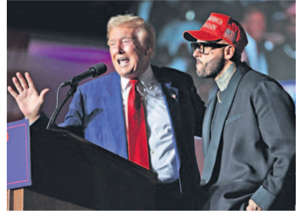
Republican presidential candidate President Donald Trump during a campaign rally in Las Vegas.

In a message to his supporters, Trump said he is safe. "There were gunshots in my vicinity, but before rumours start spiralling out of control, I wanted you to hear this first: I AM SAFE