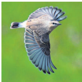
Isabelline Wheatear and Asian Brown Flycatcher.

Several wintering birds, such as the Grey Wagtail, Asian Brown Flycatcher, Greenish Warbler, Montagu's Harrier, Western Marsh Harrier, Tibetan Sand Plover, Isabelline Wheatear, Black Headed bunting, Grey-necked bunting, and many others