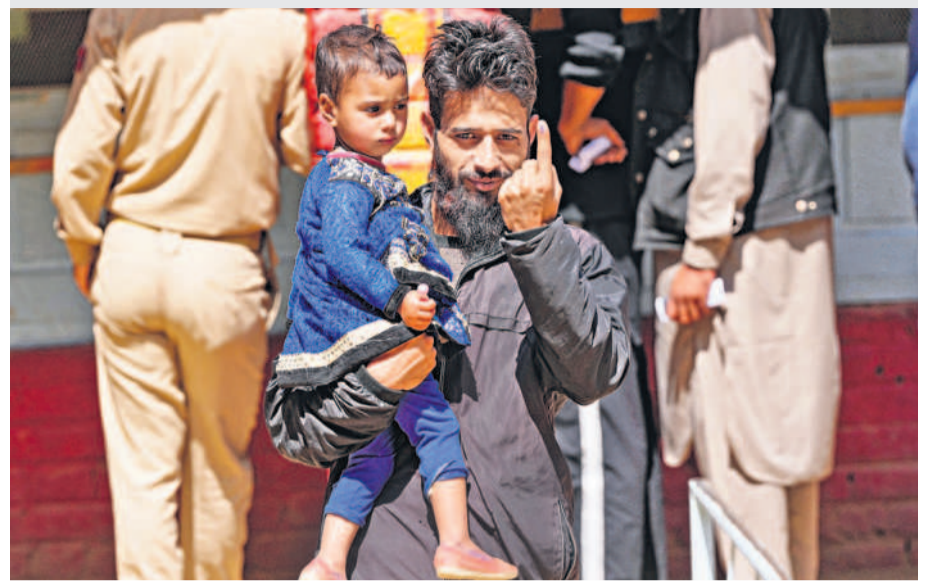
A man shows his inked finger after casting his vote in J&K Assembly polls, in Anantnag.