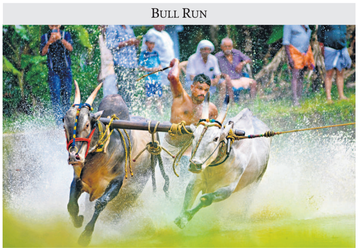
A farmer runs with his bulls during a bull ploughing competition in Kozhikode district of Kerala on Monday.

bags infested with worms. Videos of the rice were shared on social media. In one of the videos, the leaders were seen asking the staff about the poor quality rice being used in mid-day meals. The staff said the rice was stored for three months.