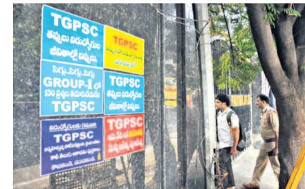
The confusion arose after TGPSA informed HC that the books could not be treated as authentic source in competitive exams.