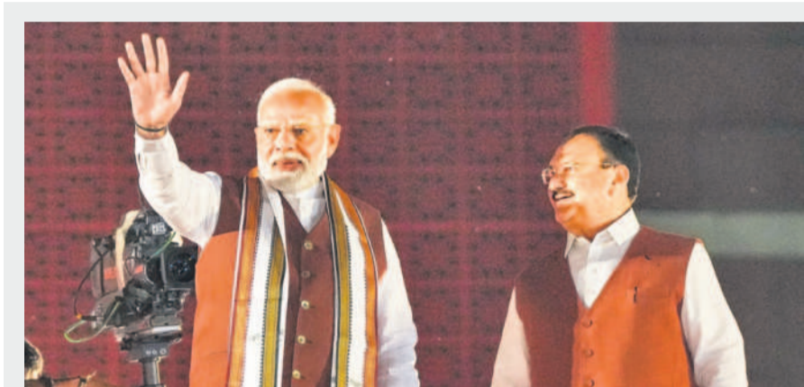
Prime Minister Narendra Modi and Union Minister and BJP national president JP Nadda at the party headquarters in New Delhi on Tuesday.

In a series of posts, Prime Minister Modi hailed BJP's performance in Haryana as a 'grand victory', saying politics of development and good governance has won. He also complimented the NC for its 'commendable' showing in J&K, and said he was proud of BJP's showing