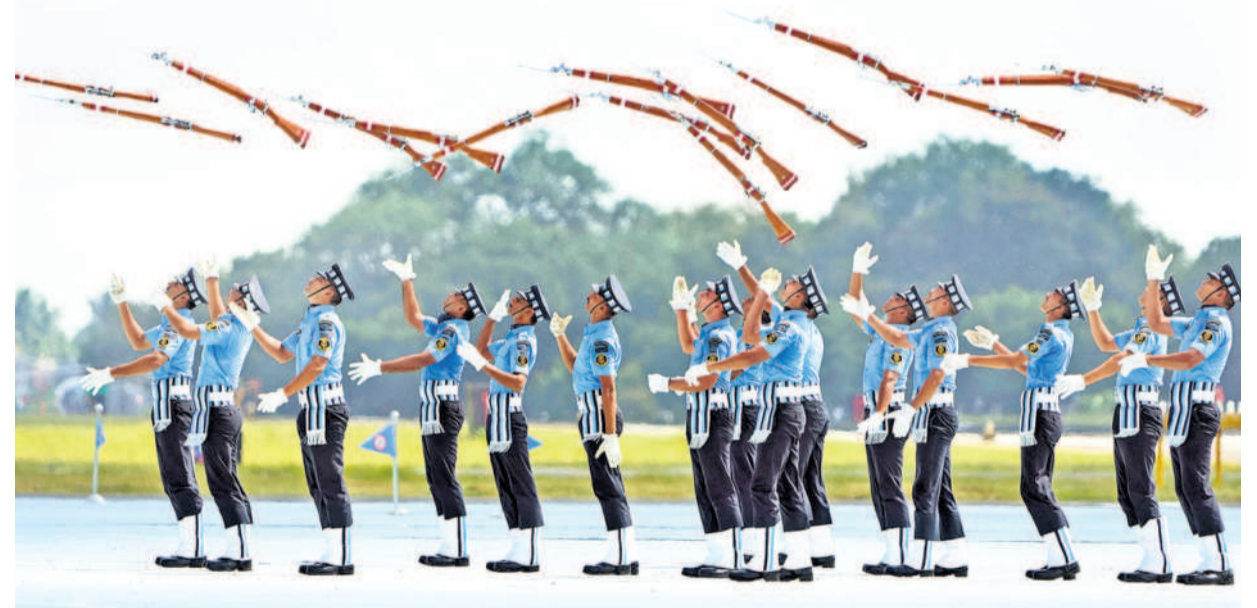
IAF personnel during the 92nd Annual Day celebrations of IAF, at Air Force Station in Tambaram, Chennai on Tuesday.