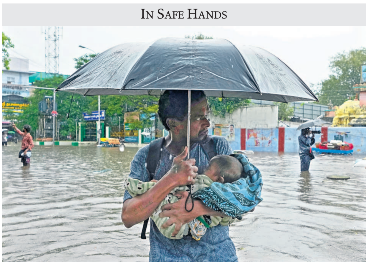
A man carrying a child wades through a flooded street during heavy rain in Chennai on Tuesday. (REPORT PAGE 7)