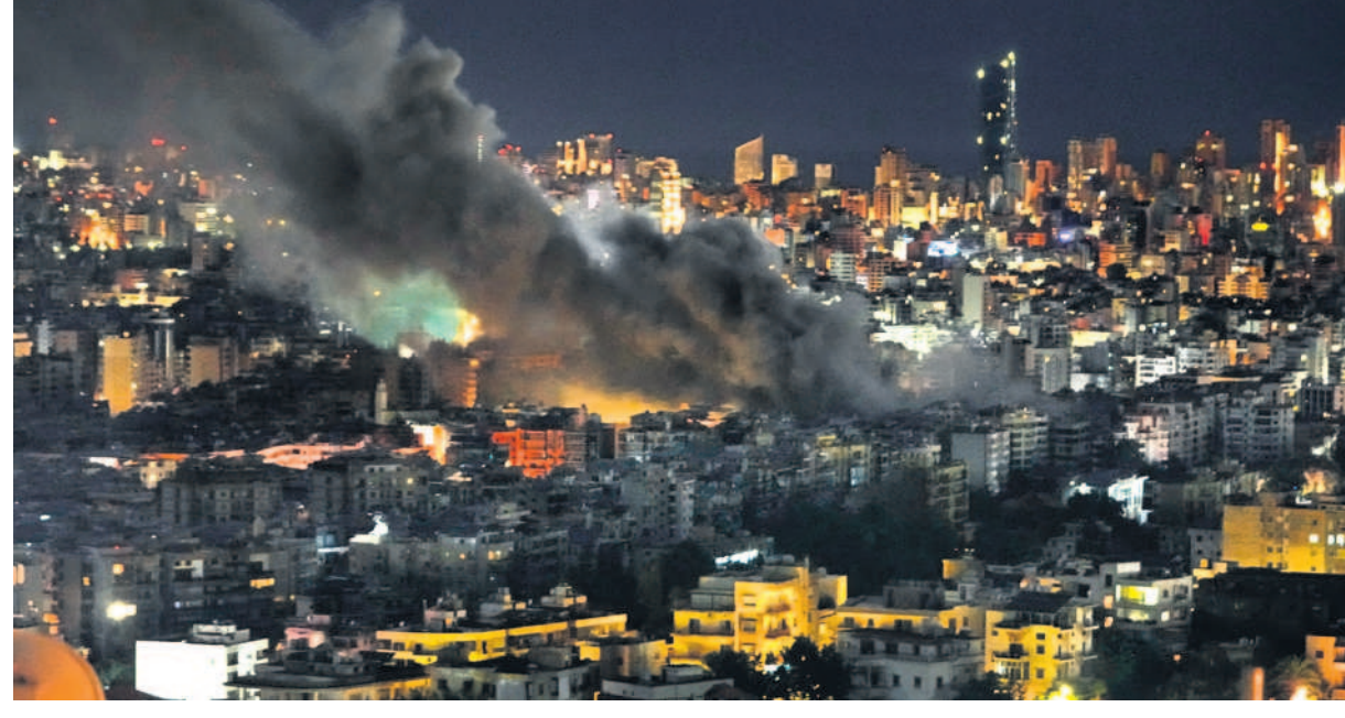
Smoke rises from Israeli airstrikes on Dahiyeh, in the southern suburb of Beirut, Lebanon, on Sunday. Meanwhile, Israeli strikes on homes in the northern Gaza Strip have left at least 87 people dead or missing. (REPORTS PAGE 9)