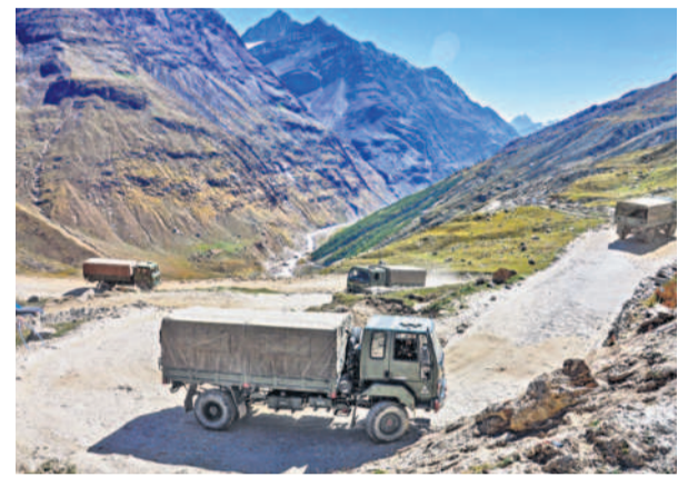
An Army convoy carrying military material on its way to Ladakh on the Manali-Leh highway.

Prime Minister Modi and Chinese President Xi are