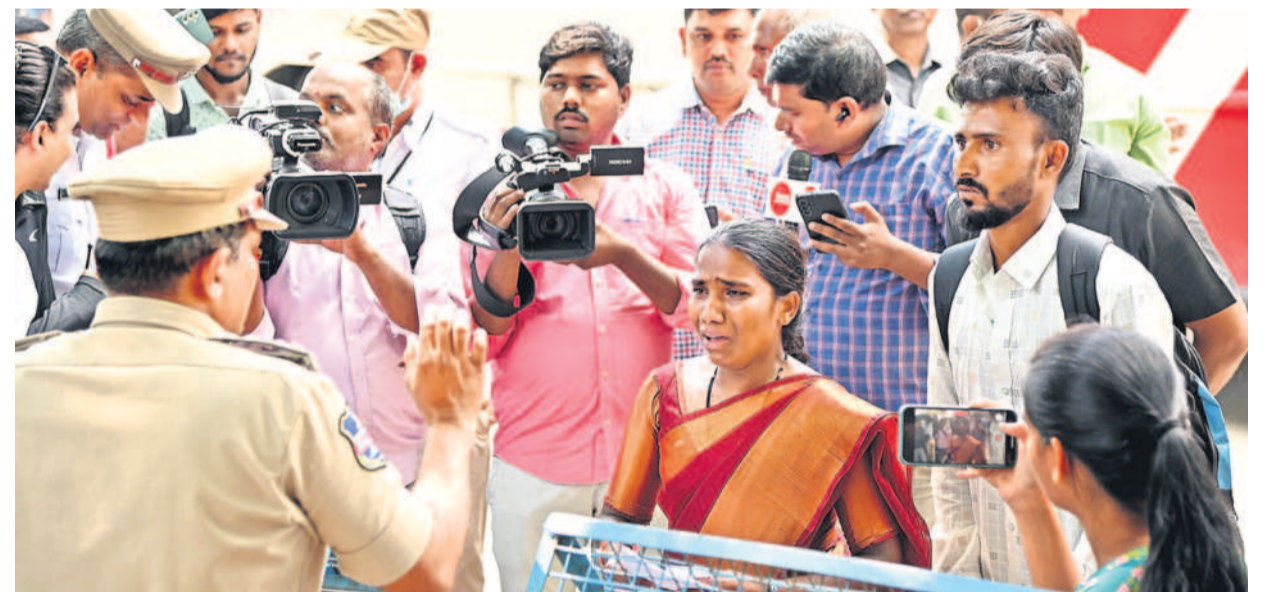
A Group-I candidate, who was denied entry into the exam centre for reaching late, weeps at the entrance of the Government Degree College for Women in Begumpet. (RELATED REPORTS PAGE 3)

Sibal submitted that the aspirants would lose out on the chance to appear in the exam being conducted for the first time in the State. Sibal, at the outset, sought